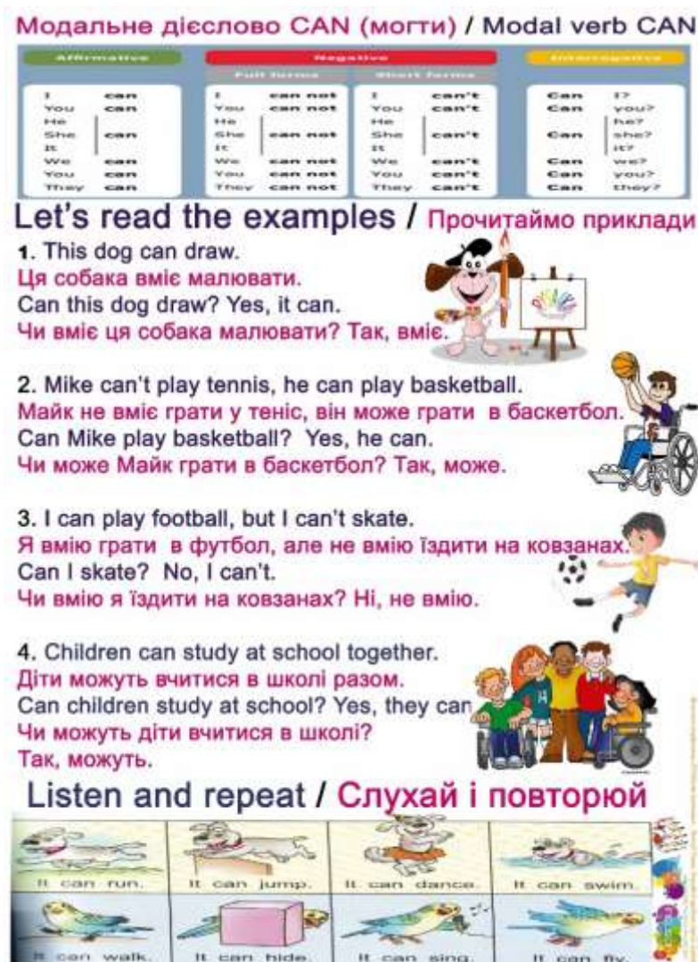
Figure 2. Poster for learning the modal Can